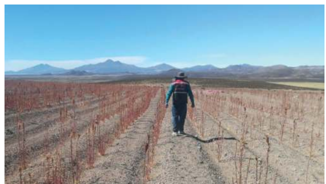
A quinoa producer walking through his crop.

This new approach required an investment of US $198,000. The procurement of machinery – including a new product line for energy bars, salted snacks and cookies – would cost another US $800,000. ANAPQUI is now in position and ready to bring its gluten-free products onto the national market. This is great news to the Bolivians as well as Agriterra's advisors. And also the consumers are satisfied!