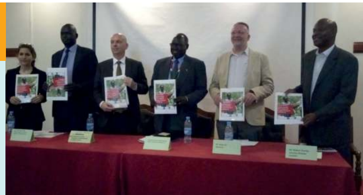
The minister of Agriculture and Food Security in South Sudan kicked off the project in Juba

This enormous growth is a result of the support from Agriterra through financing and advice about organisational development and service improvement. This service mostly entails training farmers to increase their production, introducing income-generating crops such as onions and the