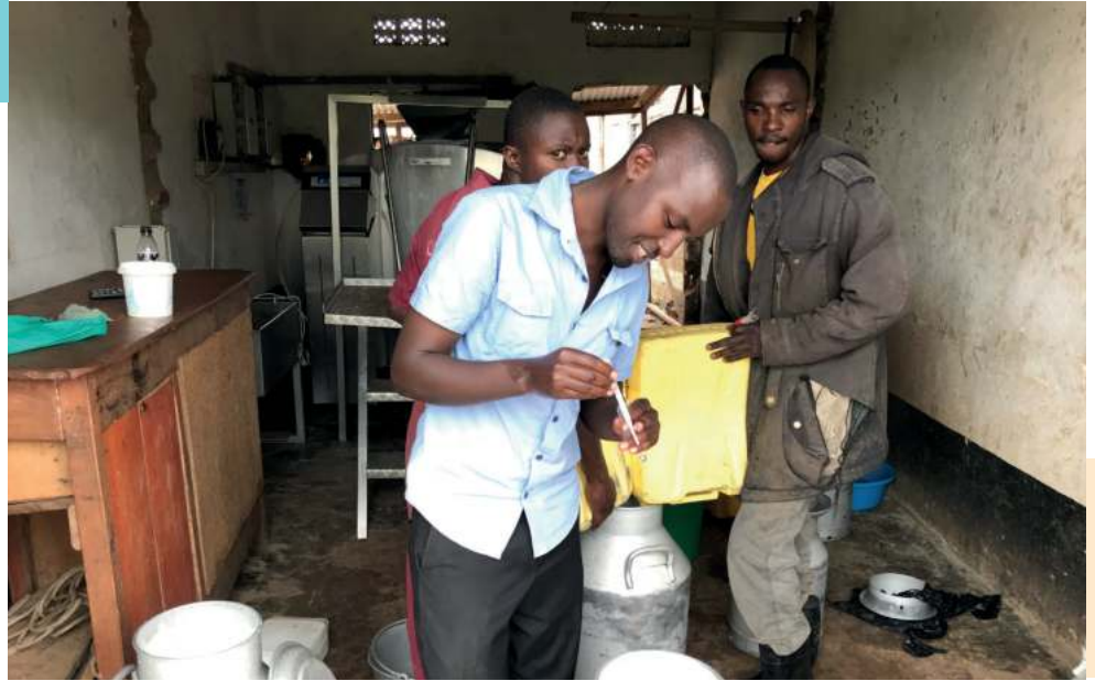
The focus is not just on marketing milk, but also on increasing its quality