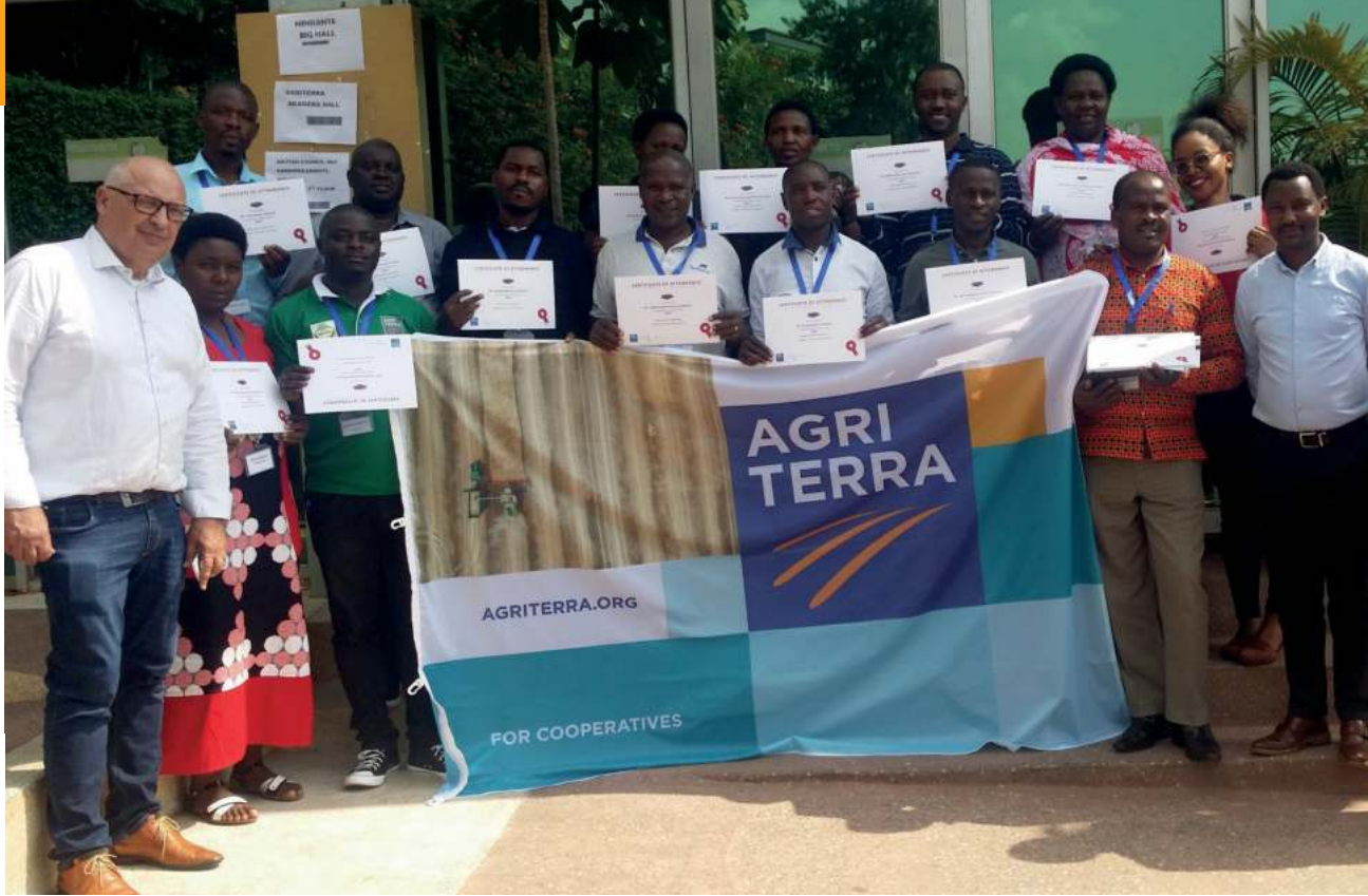
A 'FACT lessons learned workshop' was held in Rwanda in June 2019