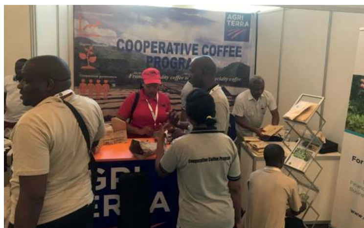
The Agriterra stand at the AFCA coffee trade fair in Rwanda had a lot of visitors

To answer these questions, Agriterra organised a workshop for cooperatives from Congo, Burundi, Rwanda, Ethiopia, Kenya and Uganda. In Kigali, representatives of these cooperatives learned from each other's experiences in